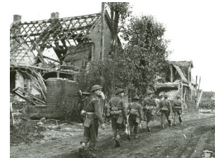
British infantry enter Overloon

Prices € 32,50 p.p. *prices from, VAT included