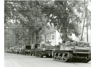
British 30 Corps at Landerd

Prices € 33,50 p.p. *prices from, VAT included