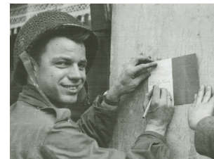
US paratrooper in Eindhoven

Prices € 17,50 p.p. *prices from, VAT included