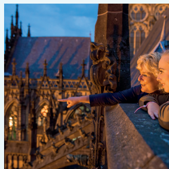
City of Den Bosch