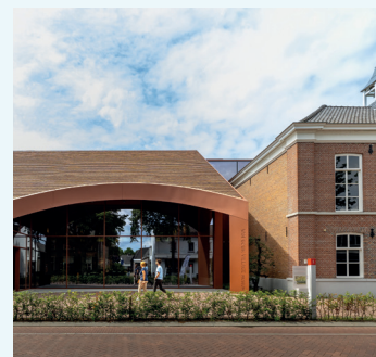
Van Gogh Village Museum - Nuenen