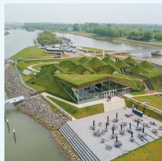
National Park De Biesbosch