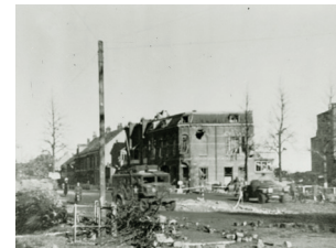
Canadian troops enter Bergen op Zoom

Prices € 32,50 p.p. *prices from, VAT included