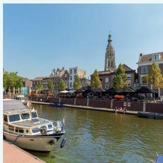
City of Breda